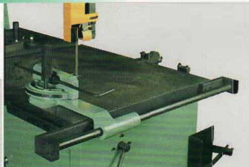
MITER GAUGE, FIXED TABLE ▲