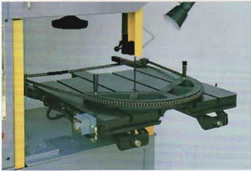
▲ WORK HOLDING JAW