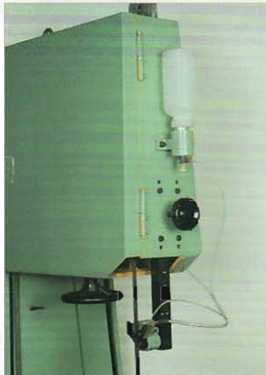
▲ SPRAY MIST COOLANT ATTACHMENT