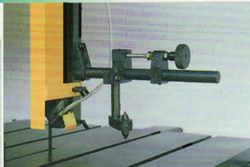
CIRCLE CUTTING ATTACHMENT ▲