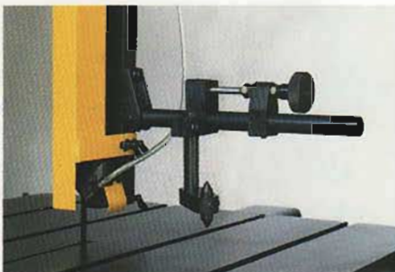
Circle Cutting Attachment