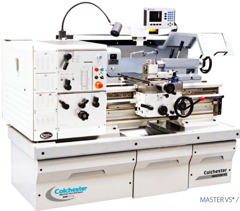
MASTER VS* /V350