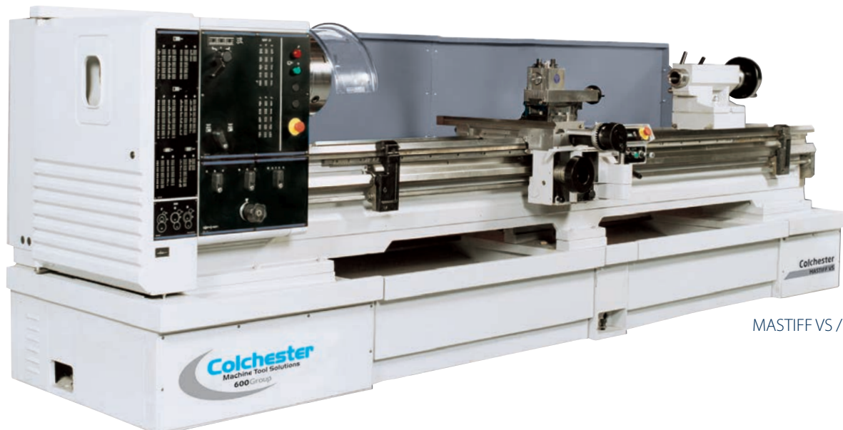
MASTIFF VS / V550