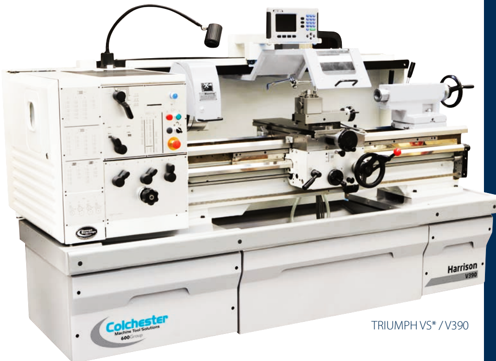
TRIUMPH VS* /V390