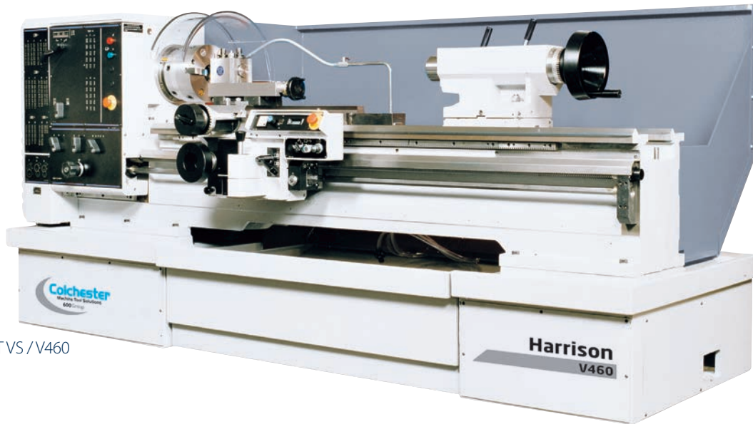
MASCOT VS / V460