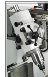
Boring spindle (Option)